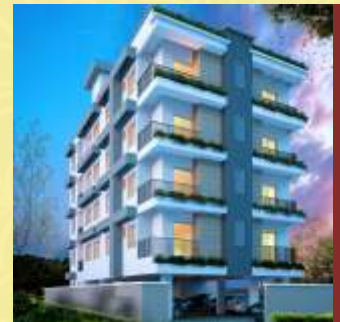
Swasthi Devi Padam Key Handing Over on September 2024