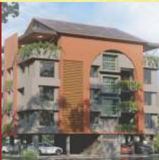
Swasthi Prakasha Mandiram