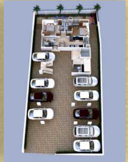
Ground Floor Parking