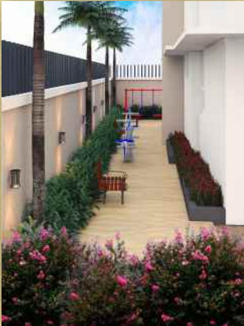
Childrens' Play Area